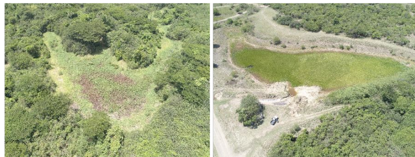
Aerial images of two agriculture ponds from 7.28.21 from behind VIDA on ST Croix show signs of slow pond recharge and continued distress of vegetation due to ongoing drought conditions.