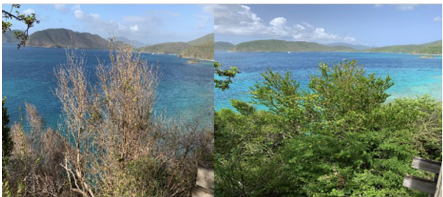
Changes in vegetation in Trunk Bay, St. John from July 7, 2020 (left) to August 5, 2020.