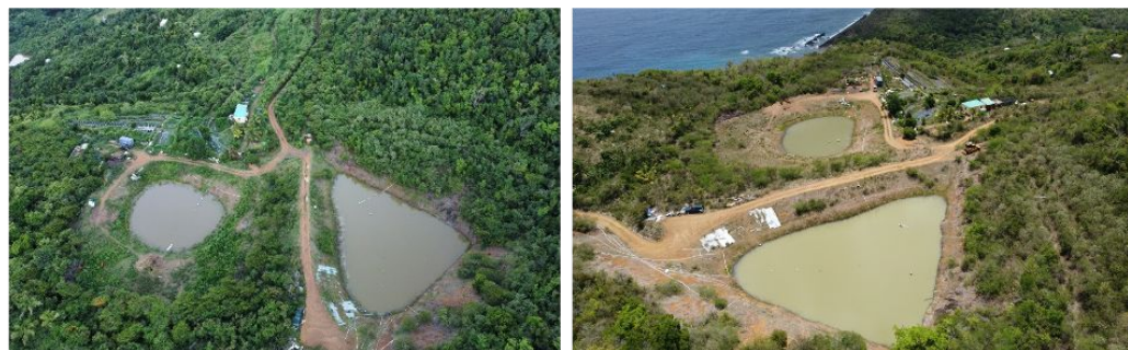
Bordeaux farmland showing Green Ridge Guavaberry Farm (right) and on May 25, 2021(left) in Bordeaux in St Thomas which was taken August 25, 2021.