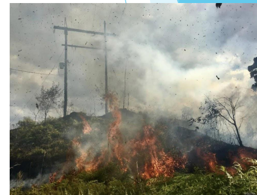
Forest fires in San Sebastian, Puerto Rico. March 3, 2021.