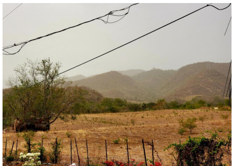
Vegetation affected by drought conditions in Barrio Jacaguas, Juana Díaz in Southern Puerto Rico. Date of photo: June 22, 2020.