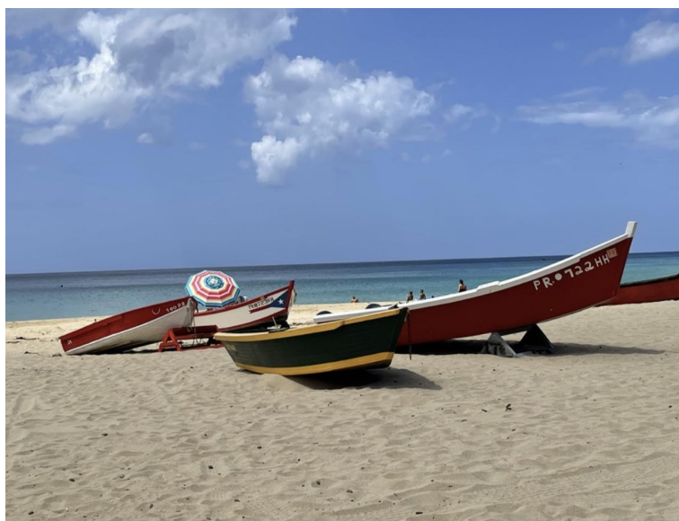
(Photo Caption: Boats sit on the shore near Aguadilla, Puerto Rico)

Obviously, their spirits fell considerably, especially because they felt that the government turned its back on them. In fact, to this day, they have not regained what they once had.