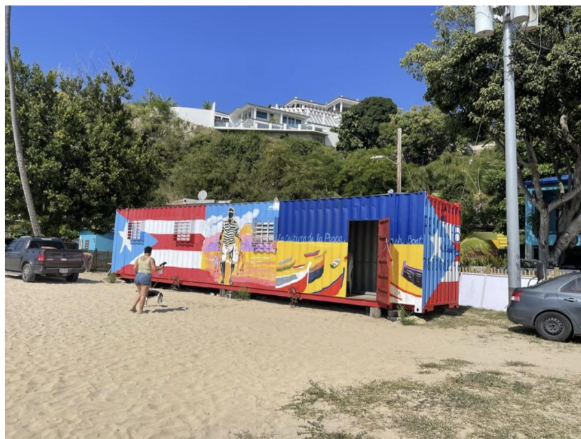
(Photo Caption: The restored, painted container in El Ojo de Agua fishing village)