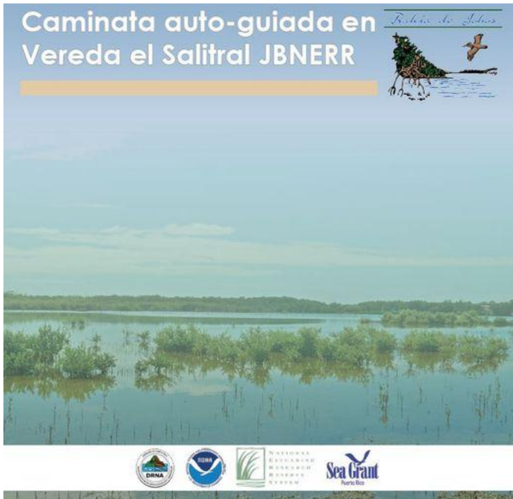
(Photo Caption: Cover of the Reference Document for Self-Guided Walks in Jobos Bay NERR)