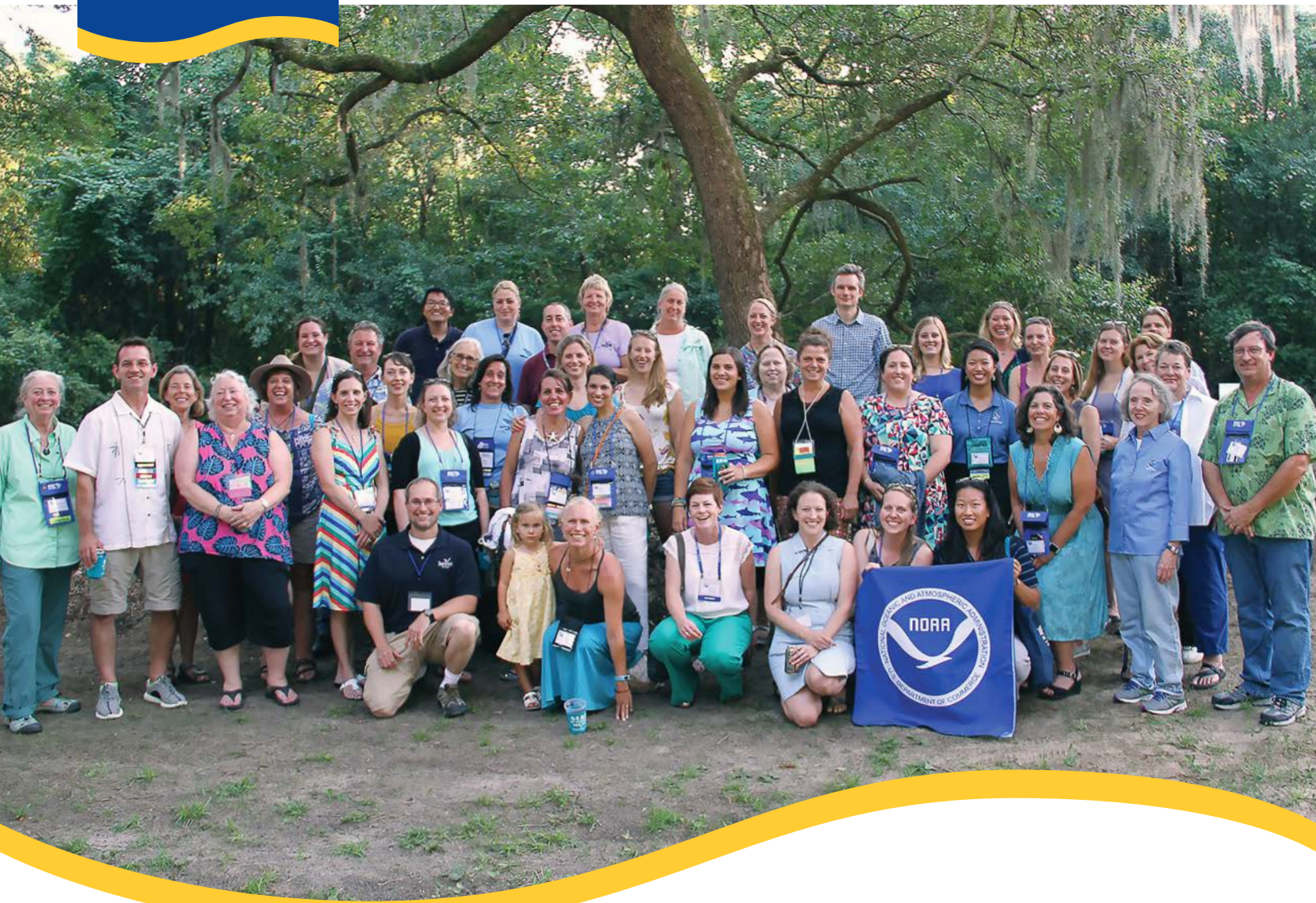
NOAA Educators at the 2017 National Marine Education Association Conference in Charleston, South Carolina.

NOAA functions in a unified manner to support, plan, and deliver effective educational programs and partnerships that advance NOAA's mission.