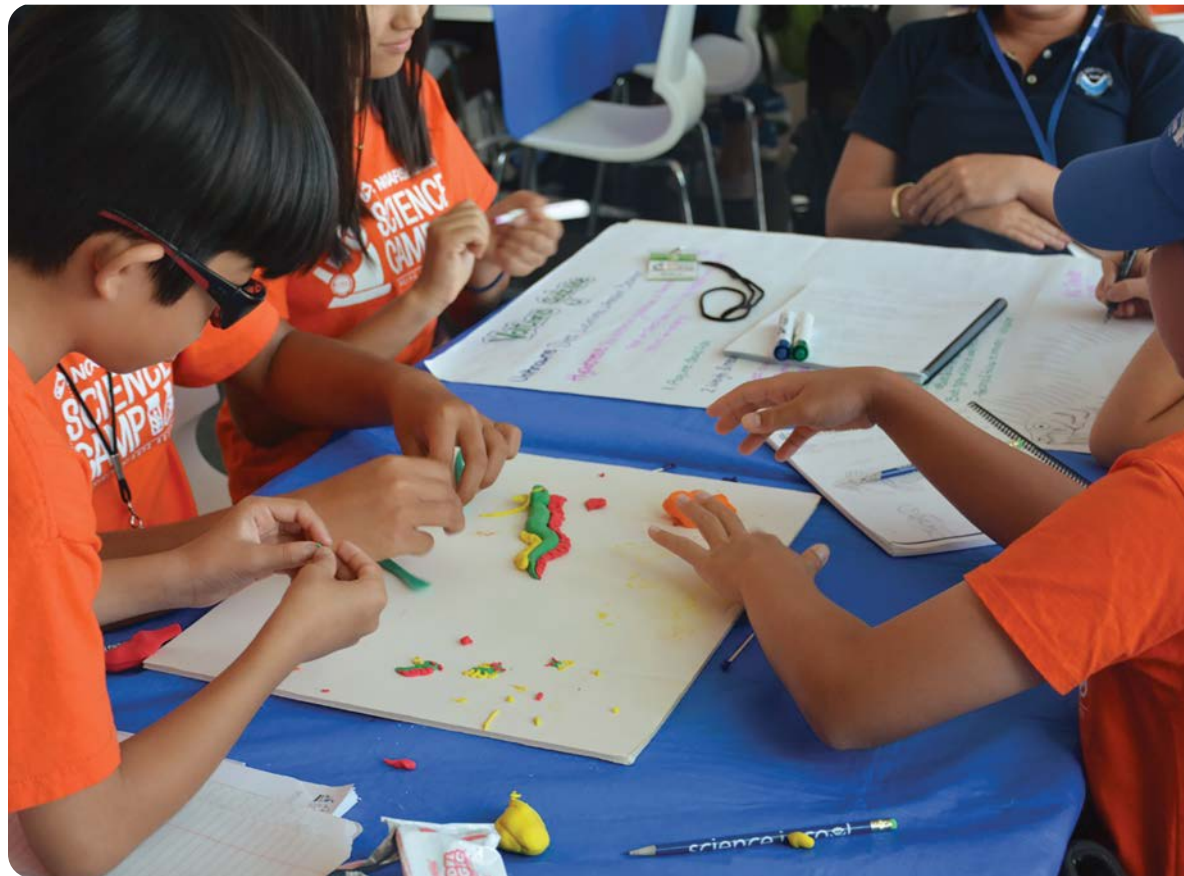
The week-long 2017 NOAA Fisheries Science Camp featured nine science modules or lessons, a field trip to a local fishpond, and a culminating mystery challenge scenario that incorporates all that the students have learned throughout the week. Here a team of 5 students prepares a research plan and fish model for their presentation.

During an annual assessment, we will document programs' progress towards their commitments in the implementation plan and establish the full portfolio of program activities that contribute to the strategic plan. This new process will build from and enhance existing internal reporting based on common measures and communicating impacts to the public.