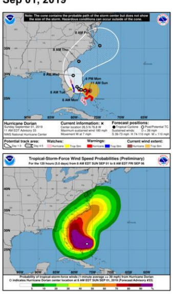
For more information go to hurricanes.gov

4. Heavy rains, capable of producing life-threatening flash floods, are possible over northern portions of the Bahamas and coastal sections of the southeast and lower mid-Atlantic regions of the United States through late this week.