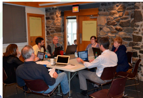
Participants at the state of the science workshop in N.H.

The first workshop was held in Maine on December 10, 2014 at the University of Maine Darling Marine Center (see www.fishermensvoice.com/201501OceanAcidification ). It involved aquaculturists, shellfish harvesters, lobstermen, and state water quality and marine resource managers to provide input on what they have seen in coastal waters, their concerns about coastal OA, and what NECAN could provide through monitoring, data and information products. Maine recently convened a commission to review the science on ocean acidification and make recommendations on how that state could address the threat that changing ocean chemistry poses to the marine ecosystem and economy, and the commission's final report was also reported at the workshop. Workshop participants noted their concerns about impacts to shellfish (both farmed and wild) and interactions with other coastal stresses such as an increase in freshwater and nutrient input. The long list of unknown impacts is troubling, and much more research is needed. However, participants appreciated that (cont. p. 2)