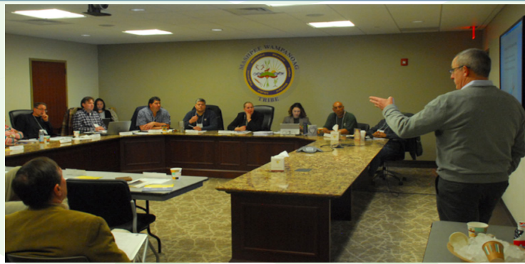
Photos from the Mashpee Wampanoag Tribal Roundtable held in March.