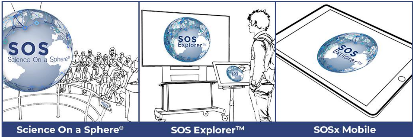
Figure 2. Suite of display options for Science On a Sphere datasets.

computer (i.e., SOSx ) and/or mobile devices (i.e., SOSx mobile ), paper globes for younger audiences to build their own models, and Virtual Reality content.