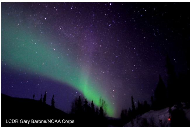
LCDR Gary Barone/NOAA Corps

Roses are red Let's spend time together Gazing at the aurora borealis A marvel of space weather