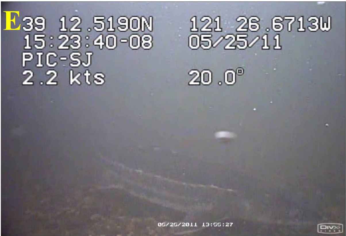
Figure 2. Five of the 29 screen captures of green sturgeon taken from underwater video surveys conducted 5/24/11-5/26/11 immediately downstream of Daguerre Point Dam, Yuba River, CA.