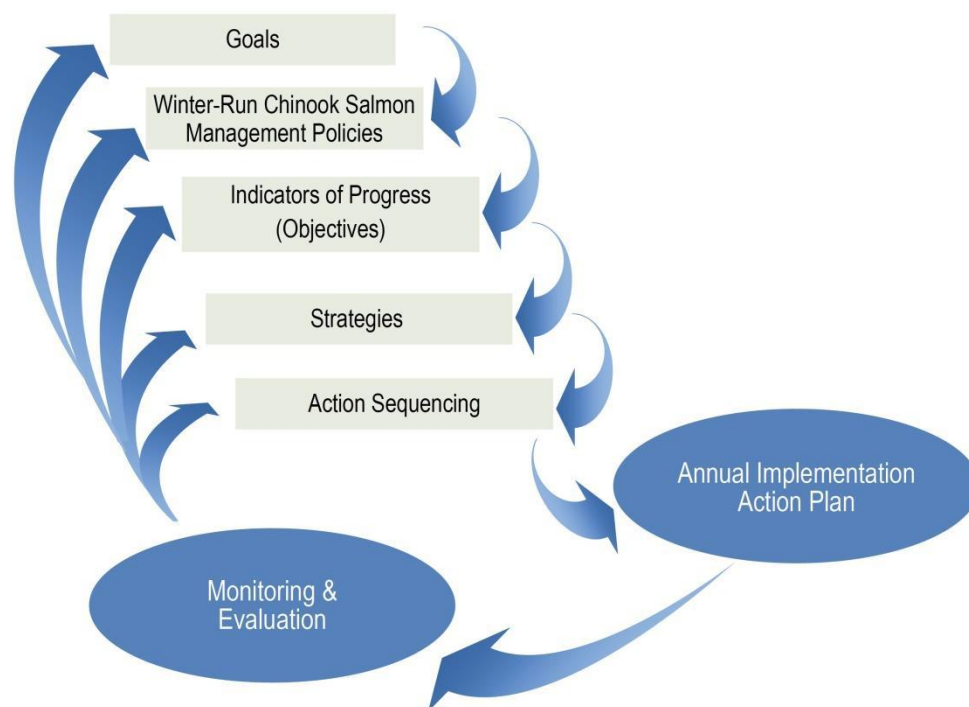
Figure 10 Adaptive Management Process

Hypothesis Testing. The Reintroduction Plan has been developed based on a set of assumptions or hypotheses reflecting the best information available prior to implementation of the plan. These hypotheses are key to the structure and success of the plan, and should be tested through monitoring and evaluation. Where hypotheses are not supported, the need for revisions to strategies or schedules will be identified and considered.