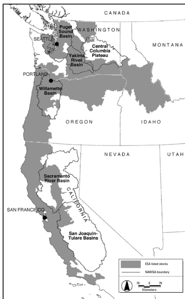
Figure 1. The geographic distribution of threatened and endangered salmon in the western United States overlaps with study units from the USGS NAWQA program. Dashed lines mark the boundaries of NAWQA study areas where pesticide concentrations have been measured in surface waters. Gray shaded areas show the freshwater range of ESA-listed salmon populations.

renewal schedule. Animals were not fed during the exposure interval. After exposures, fish were terminally anesthetized by immersion in MS-222 (tricaine methanesulfonate, 5 g/L; Sigma Chemical Co., St. Louis, MO) until gill activity ceased. Brain tissues were removed, put into plastic microcentrifuge tubes, and kept on ice until stored in a cryogenic (−80°C) freezer for subsequent analyses of AChE enzymatic activity. In the three mixture exposures where mortality was observed, dead fish were